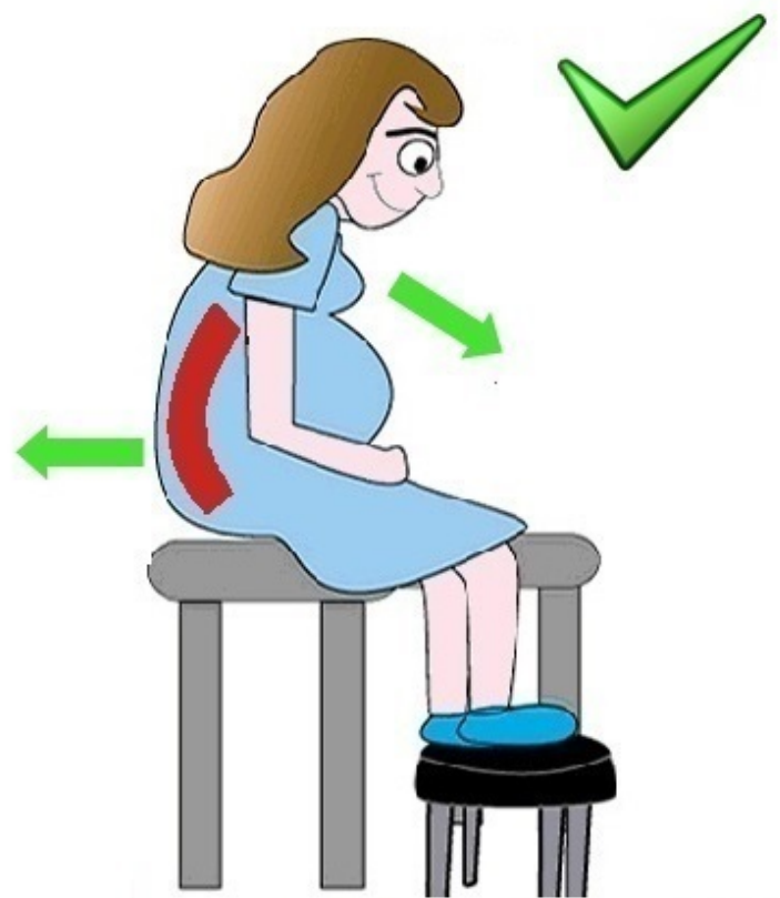
Sturme, Chambers & McNamara